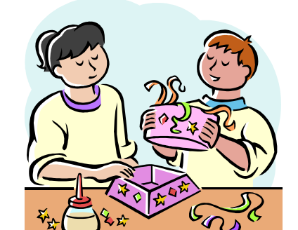
It is God's desire that we emulate

PS. Check out this website for ideas <a href="www.niemmaus.com/agape">www.niemmaus.com/agape</a>